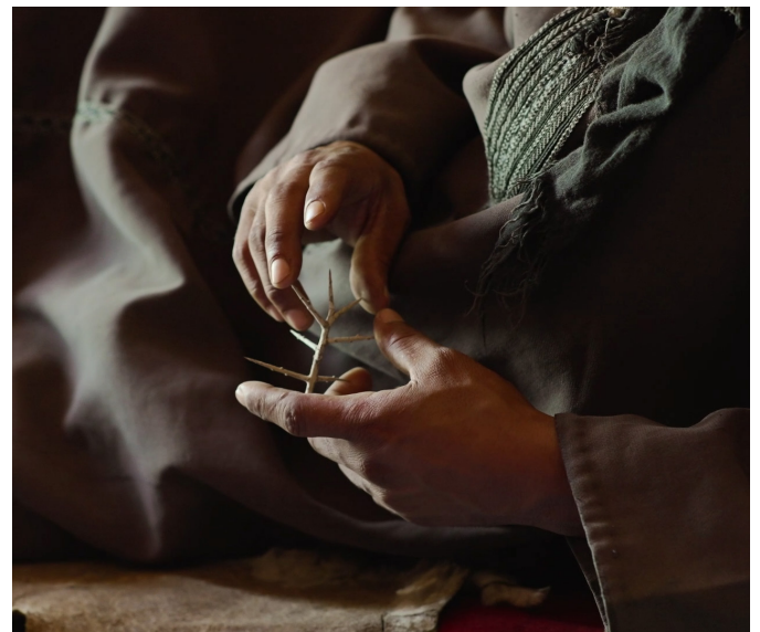
Abdessamad El Montassir, Trab'ssahl , 2023 © Abdessamad El Montassir / ADAGP, Paris

Événement organisé dans le cadre de la Saison Méditerranée 2026