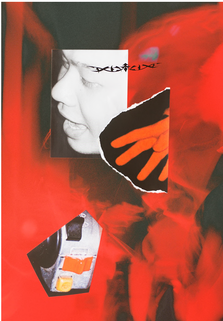
Prune Phi, Starter (projet Hang Up) , 2020 photographs, stickers for motorbikes Supported by the Ateliers Médicis, the French Institute of Vietnam in Ho Chi Minh City