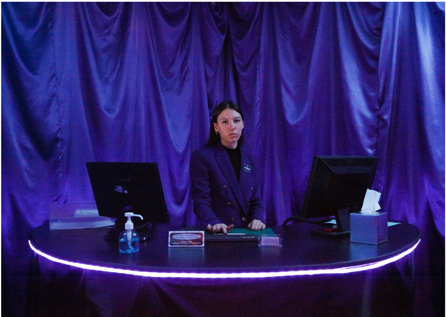
Prune Phi, Otherworld Communication , 2021 mixed media installation-performance at the Festival Parallèle, "Confessions Nocturnes" at Artagon Marseille (2022) Supported by Ateliers Médicis